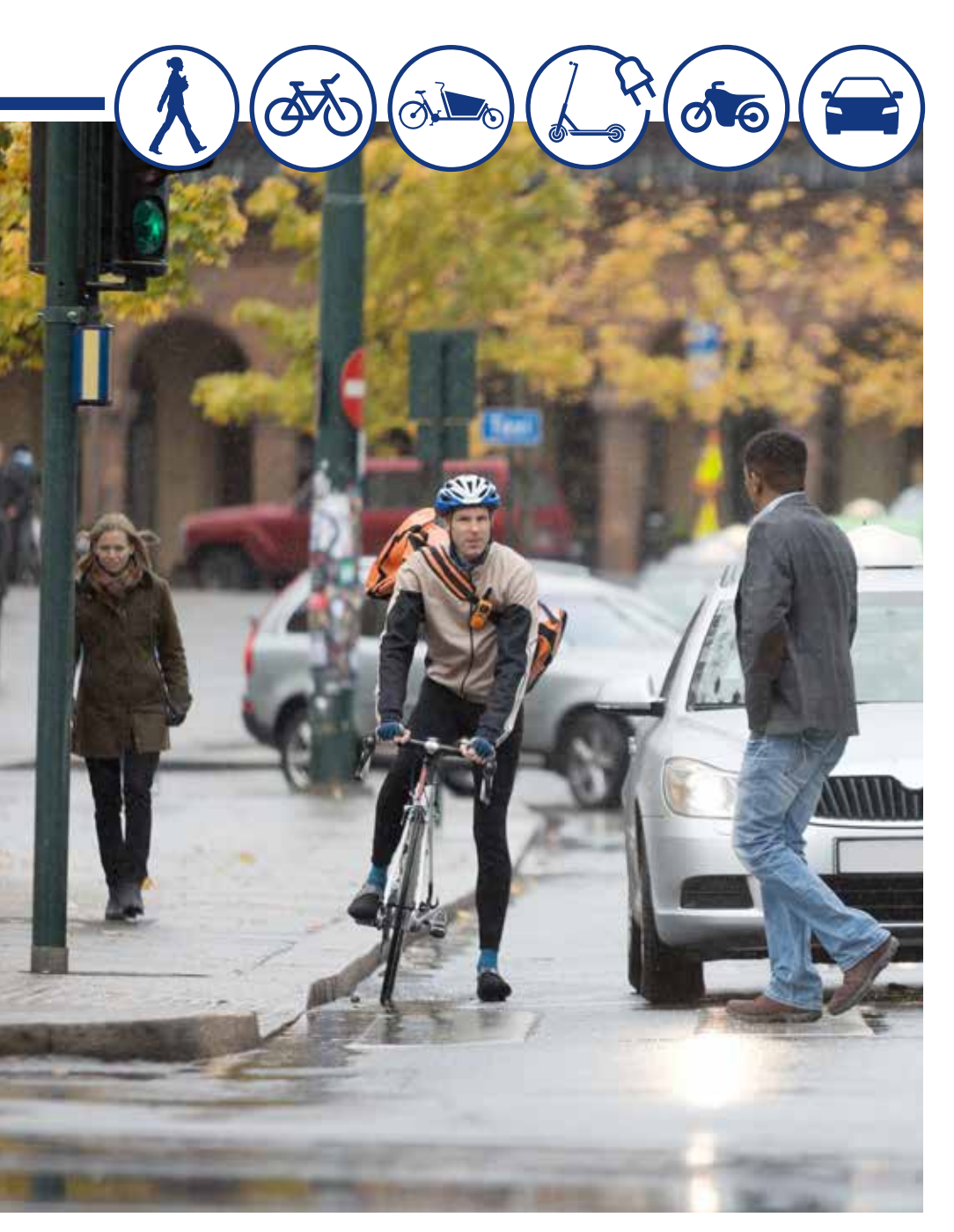
2 | Getting around in Germany