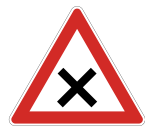
Junction with priority from the right

At junctions of various kinds that may be difficult to notice, road signs draw your attention to them. Here, too, the "right before left" rule applies.