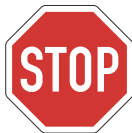
Stop! Give priority