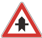
Priority at the next junction