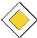
Road with priority

If you see these road signs, other drivers have to give you priority.